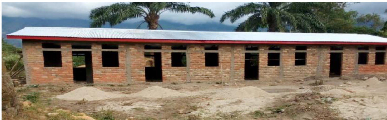
Ongoing construction works at Ep Maendeleo in Fizi HZ