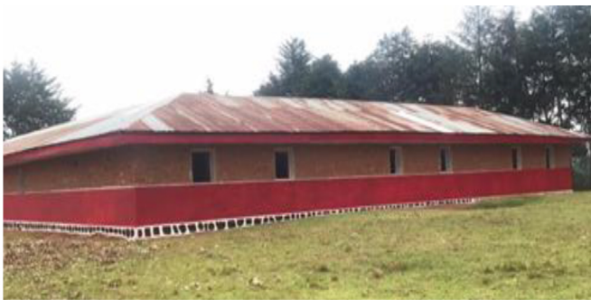
Rehabilitated 3 classrooms, an office and 3 latrines at EP RUNUNDU in Minembwe HZ