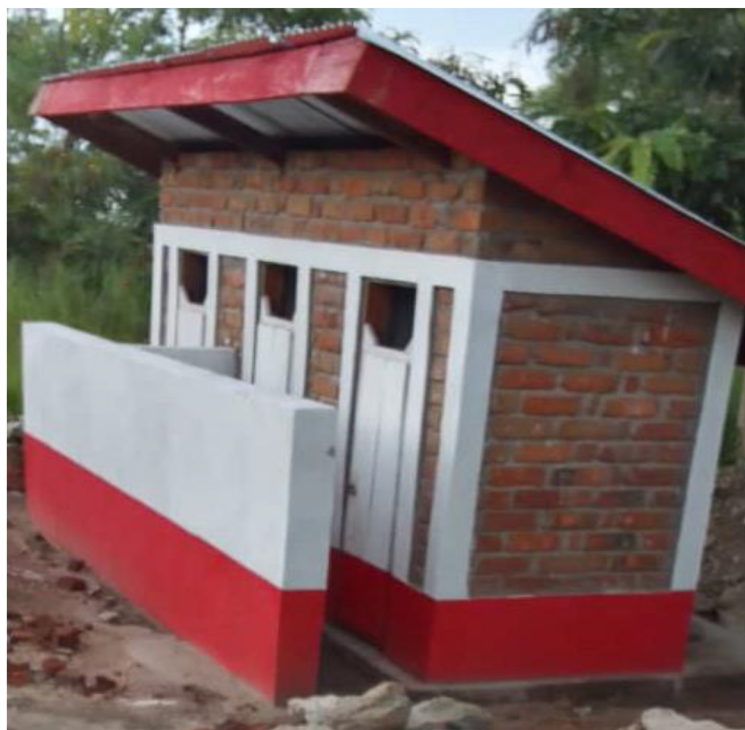
Latrine constructed as part of school construction work in EP Hakima in Fizi

Our protection teams successfully reunited 40 unaccompanied and separated children (UASC) with their families or placed them in appropriate care arrangements. Each reunification process was carefully managed to ensure the child's emotional and physical well-being, providing them with the stability they need to thrive in their communities. The reunifications are a critical component of our broader child protection efforts, aimed at restoring family unity and offering these vulnerable children a chance to reclaim their childhood.