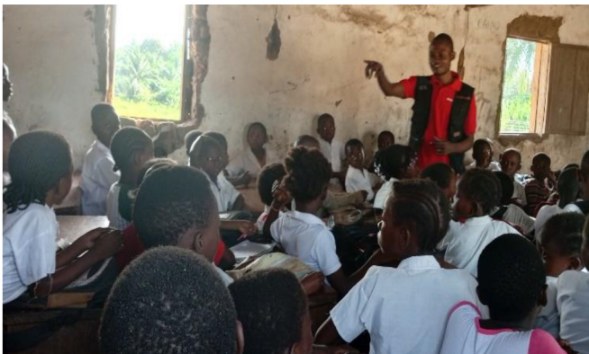
Sensitization students of EP KALONDA in Salamabila on the importance of education